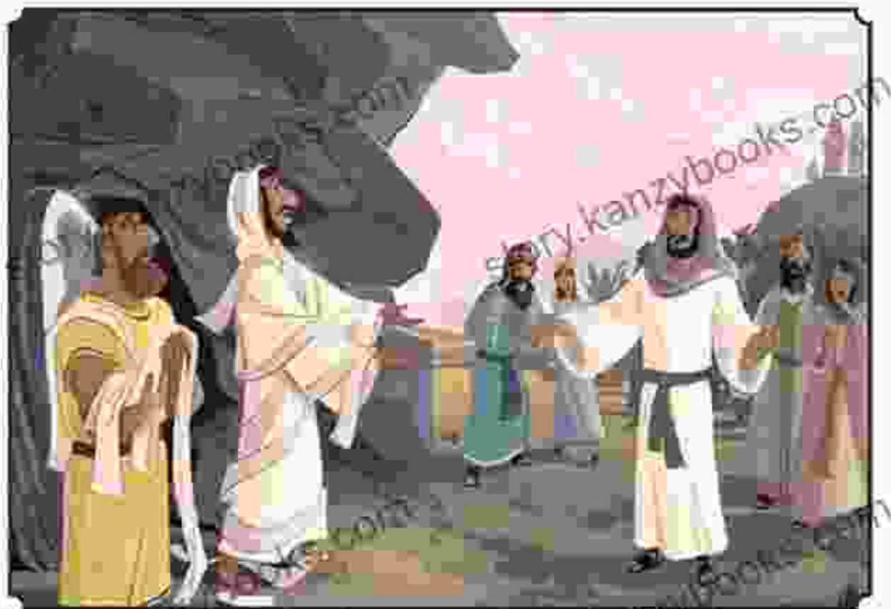
Jesus Raised Lazarus From the Dead